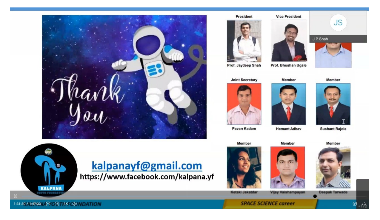
Fig. Snapshot of webinar presentation

Accredited by NAAC as 'A++' Approved by AICTE S ISO 21001:2018 Certified Campus: Green Fields, Vaddeswaram - 522 302, Guntur District, Andhra Pradesh, INDIA. Phone No. +91 8645 - 350 200; www.klef.ac.in; www.klef.edu.in; www.kluniversity.in Admin Off: 29-36-38, Museum Road, Governorpet, Vijayawada - 520 002. Ph: +91 - 866 - 3500122, 2576129