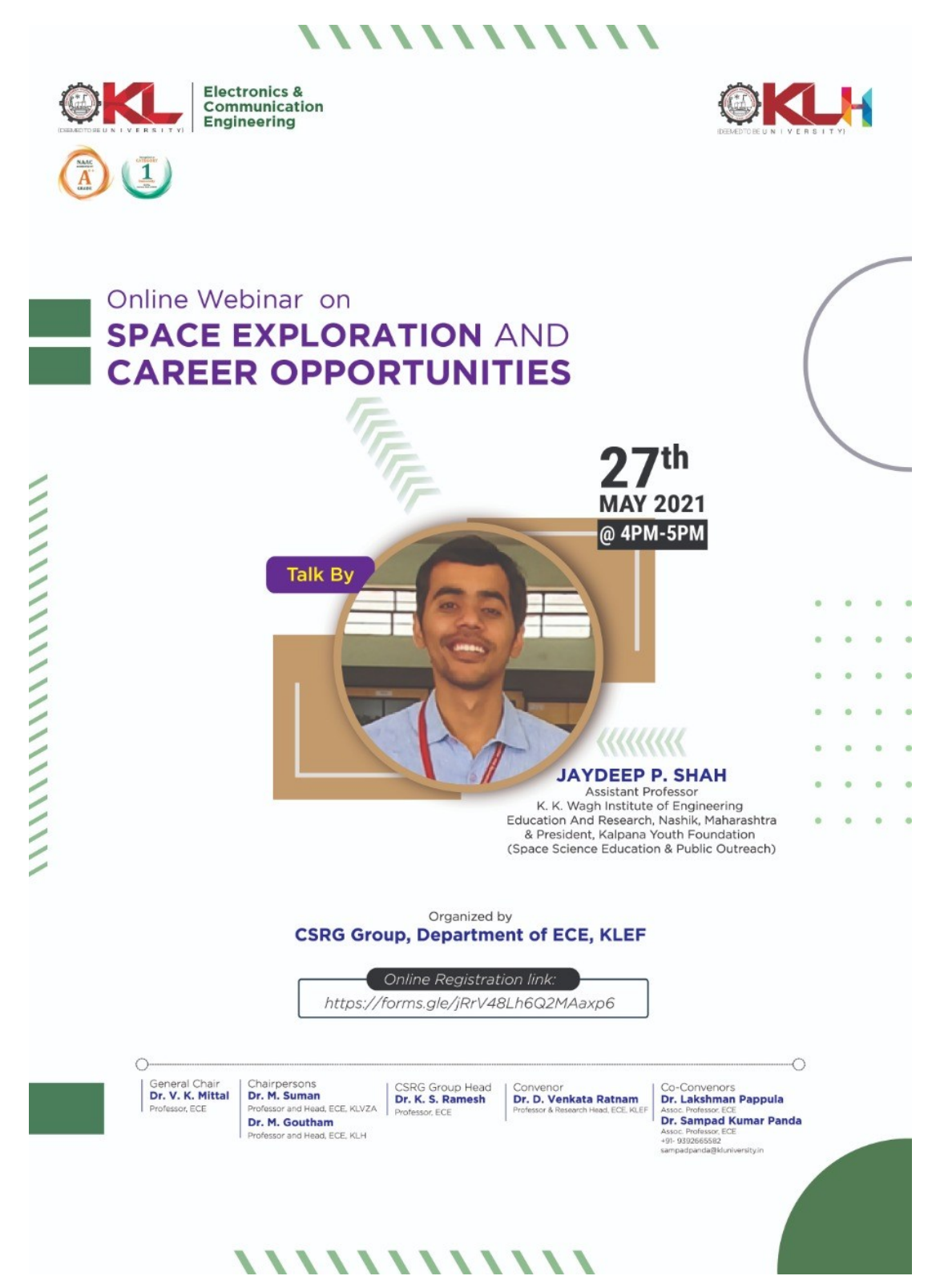
Fig. Poster of webinar